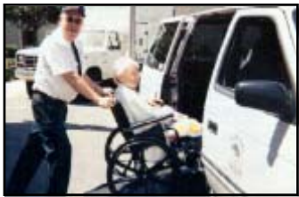
Door-to-door courteous service is provided

The Dial-A-Ride service is available to residents of the City of Westlake Village (Los Angeles